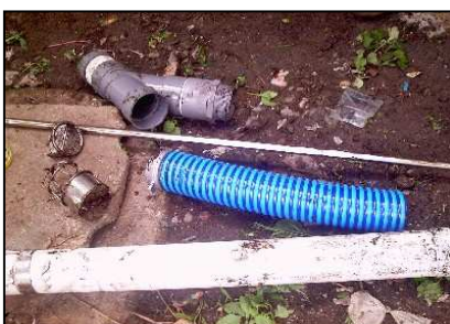
Take apart all parts of the pump.