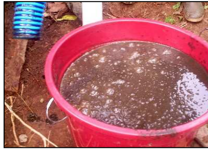
Pump the sludge into the bucket for transport to the hole.