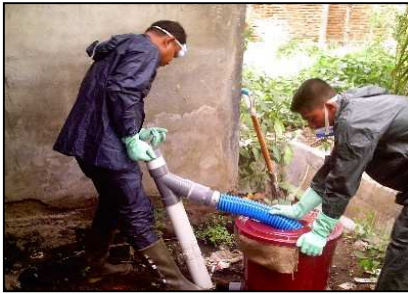
Pump the sludge out of the septic tank