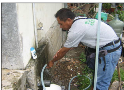
Wash your hands with soap and water after desludging and cleaning all tools.