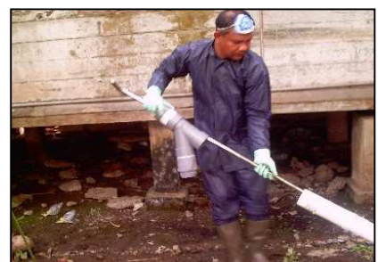
Put the pump back together and oil the metal parts.