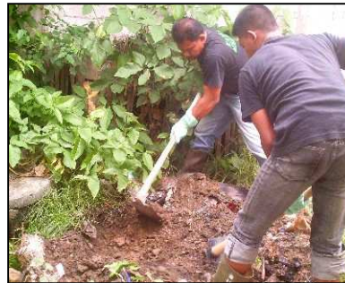
Sludge disposal site