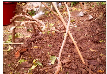
Mark the sludge disposal site with a wood or bamboo fence.