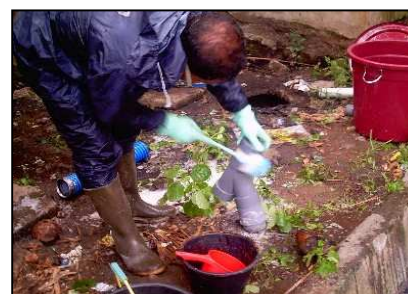
Wash all of the pump parts and protective equipment with soap and water.