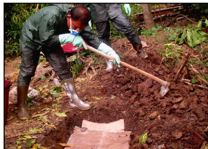
Cover the hole with soil.