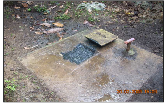
Full Septic Tank