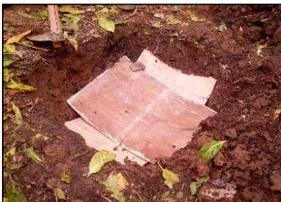
Cover the sludge in the hole with wood or bamboo.