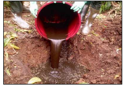
Dump the sludge into the hole that has already been dug.